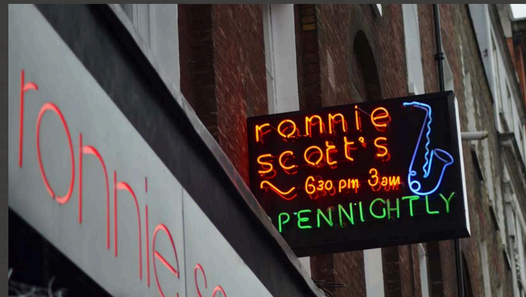
Ronnie Scott's Jazz Club