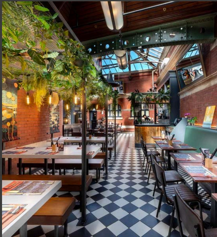
Banana Tree Soho