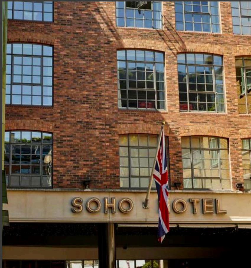
The Soho Hotel