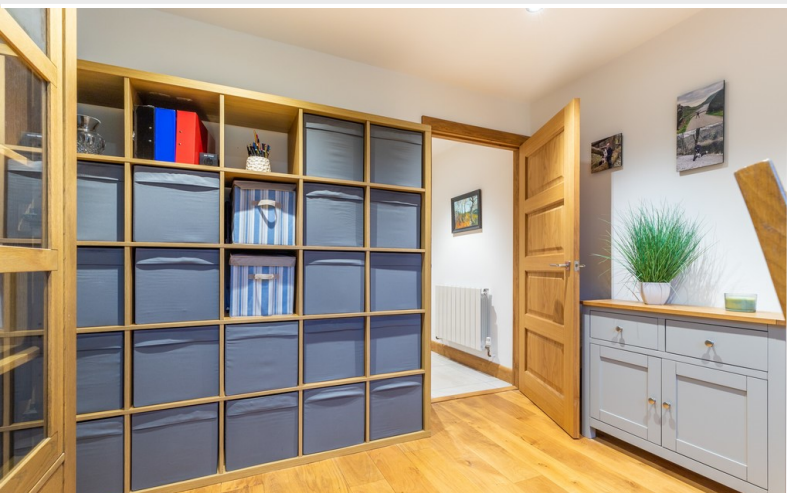
Office/ Bedroom Five