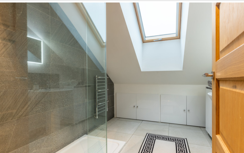
En-suite Shower Room