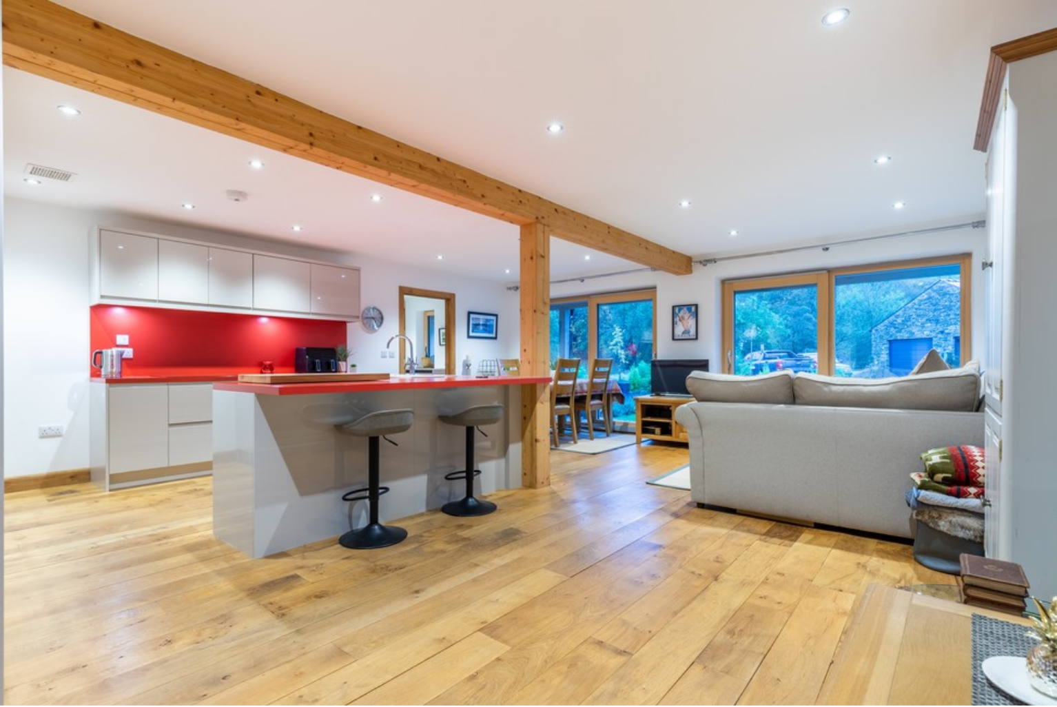
Kitchen/ Dining/ Living Room