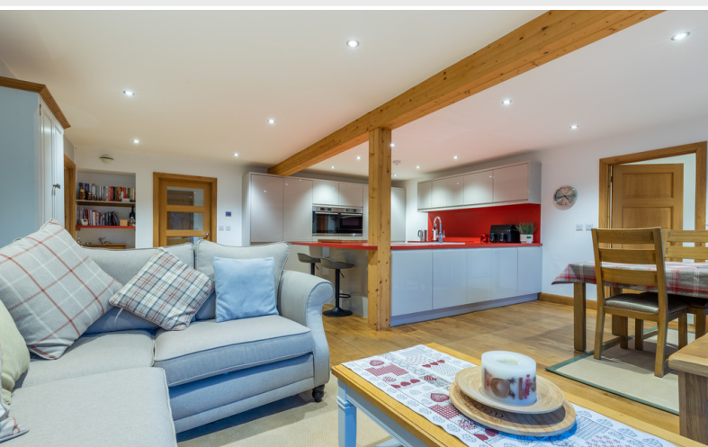
Kitchen/ Dining/ Living Room