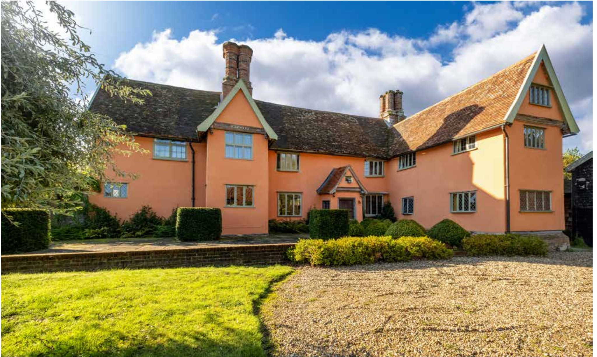
The Priory Brandeston | Suffolk | IP13 7AU