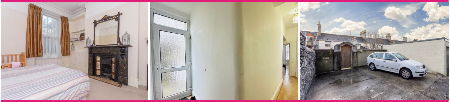
GROUND FLOOR 868 sq.ft. (80.6 sq.m.) approx.