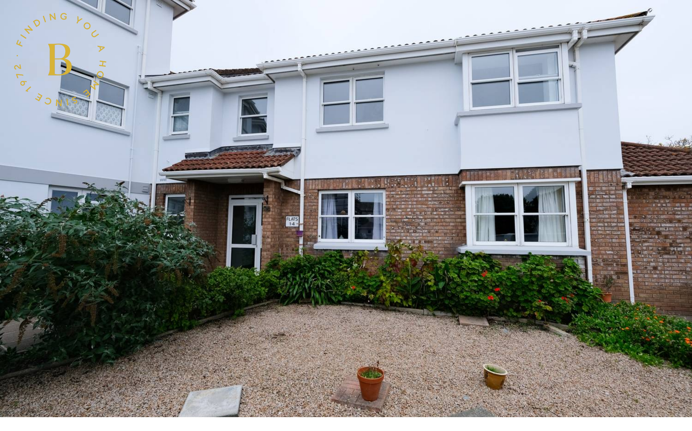
2 Gordon le Breton Close Plat Douet Road, St. Saviour £225,000* (after 25% Andium contribution. Full asking price £300,000)