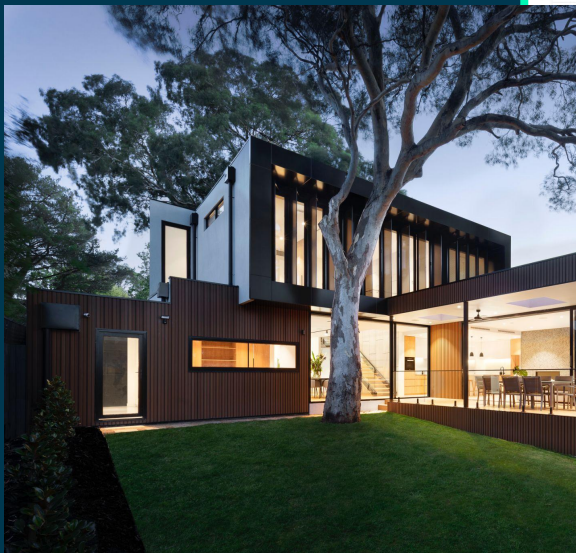
Ash Wood Court, Chorley, PR7