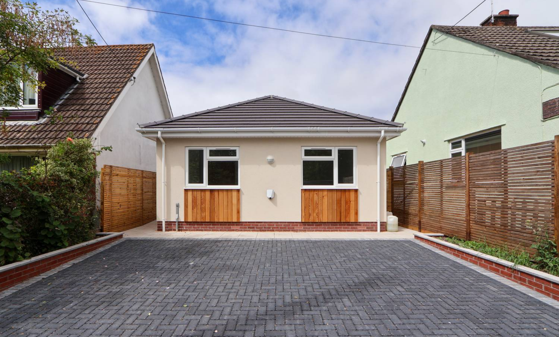
3A Station Road, Yatton - BS49 4AJ