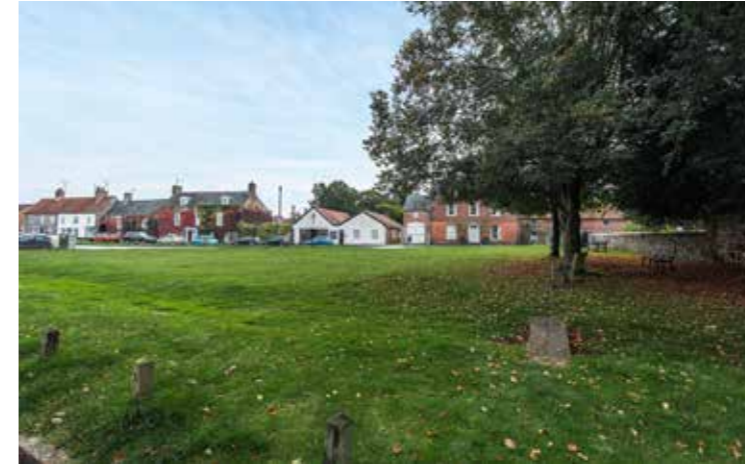
Fairstead Green, Burnham Market.

“The location is so quiet, yet a stone's throw from the hustle and bustle...”