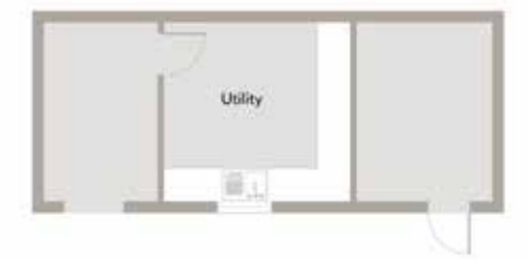
Annexe Approximate Floor Area 276 sq. ft (25.60 sq. m)

Whilst every attempt has been made to ensure the accuracy of the floor plan contained here, measurements of doors, windows, rooms and any other items are approximate and no responsibility is taken for any error, omission, or mis-statement. This plan is for illustrative purposes only and should be used as such by any prospective purchaser or tenant. The services, systems and appliances shown have not been tested and no guarantee as to their operability or efficiency can be given.