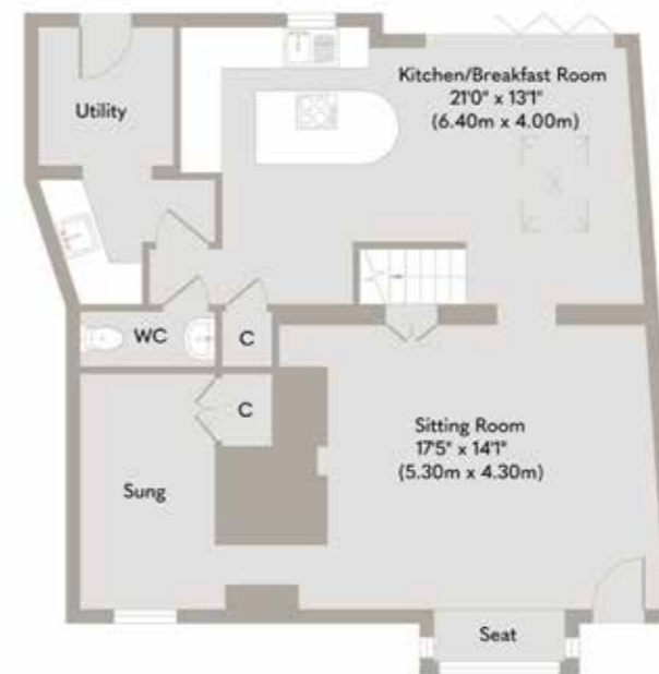
Ground Floor Approximate Floor Area 760 sq. ft (70.63 sq. m)