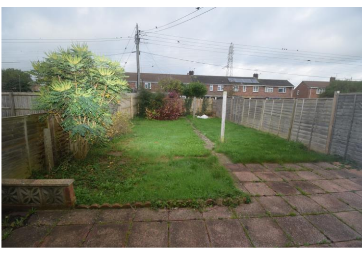
Bridgwater is an emerging town situated in the heart of the borough of Sedgemoor and within 11 miles of Taunton and 38 miles of Bristol. The town which is famed for its annual carnival is a thriving place with many new jobs being created in recent years. For more information or an appointment to view please contact the vendors sole agents.

SERVICES: Mains gas, electricity, water and drainage HEATING: Gas fired central heating system