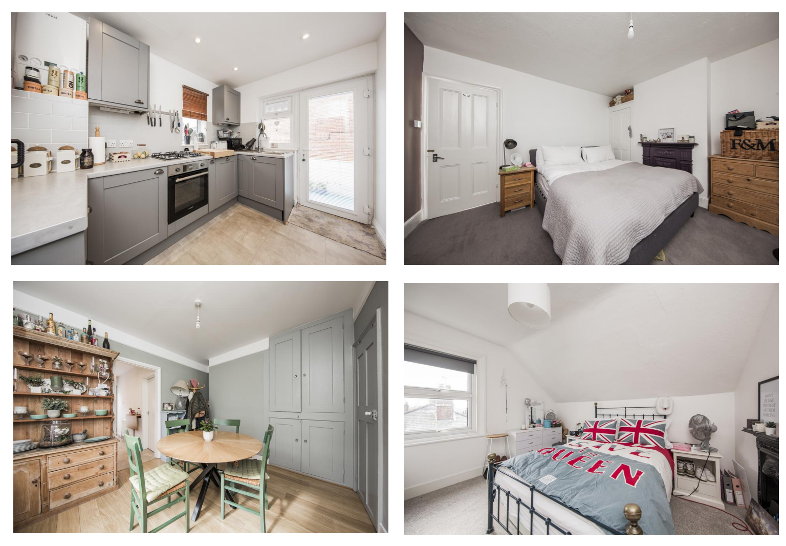
Vale Road, Southborough, Tunbridge Wells, TN4 0QQ

We are delighted to present this Victorian semi-detached four double bedroom family home, offering spacious accommodation over three floors and set in a quiet road close to Southborough common and local amenities.