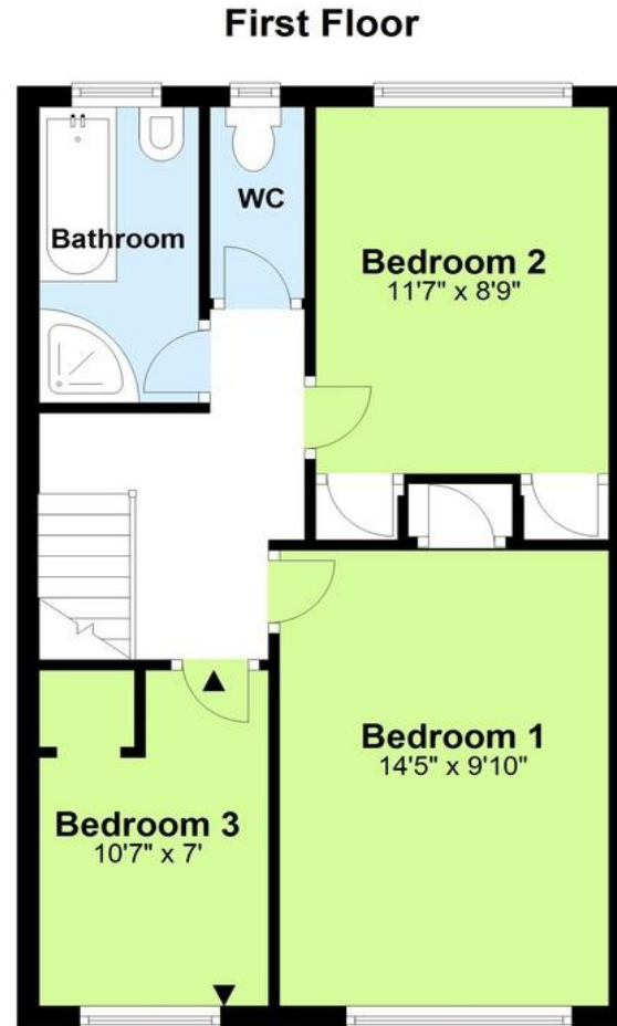
For illustrative purposes only. Not to scale. Plan produced using PlanUp.