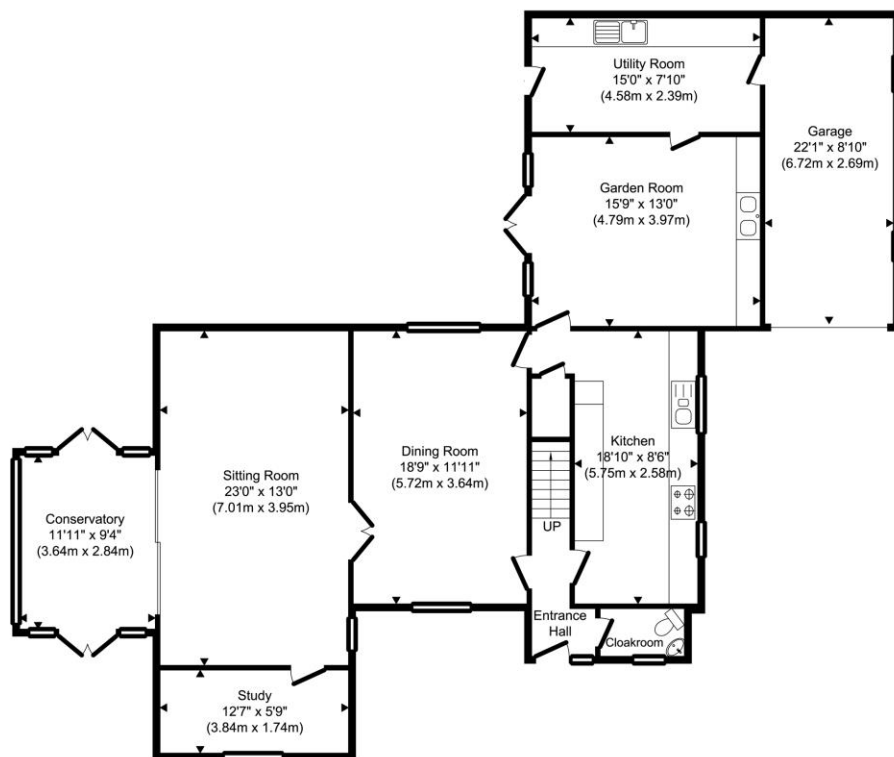
Ground Floor Approximate Floor Area 1509.31 sq. ft. (140.22 sq. m)