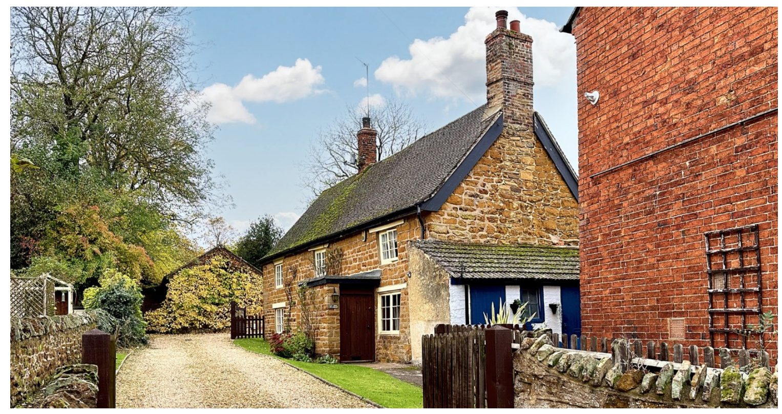
3 Bedrooms | 1Bathroom | 3 Reception Rooms | Double Garage