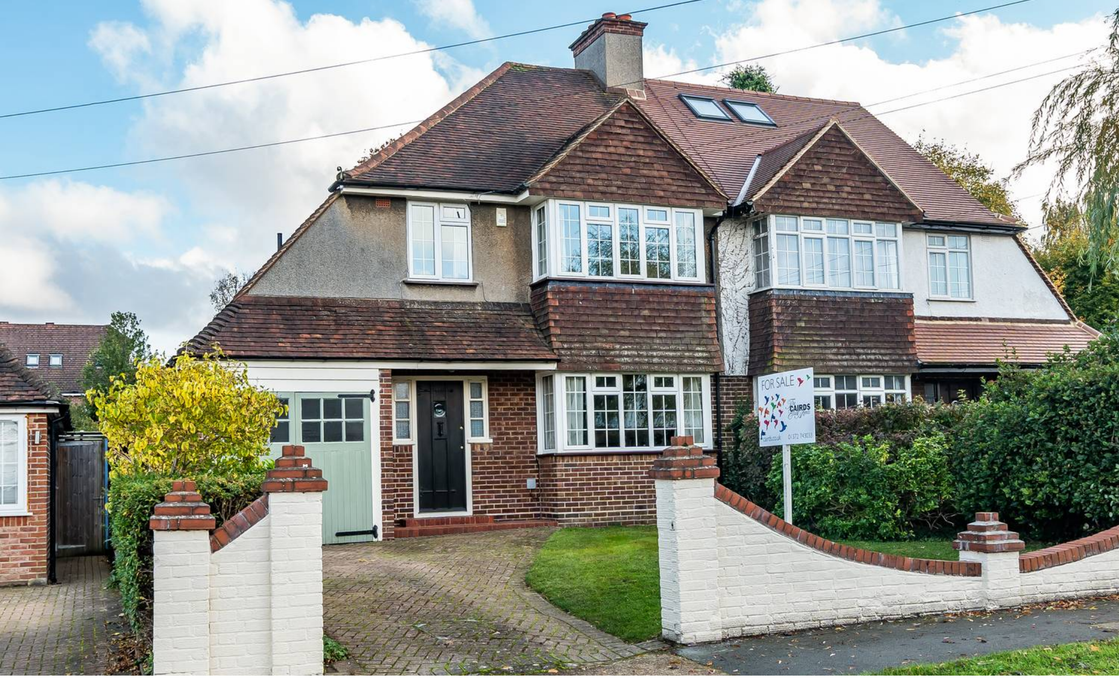
Ruden Way, Epsom