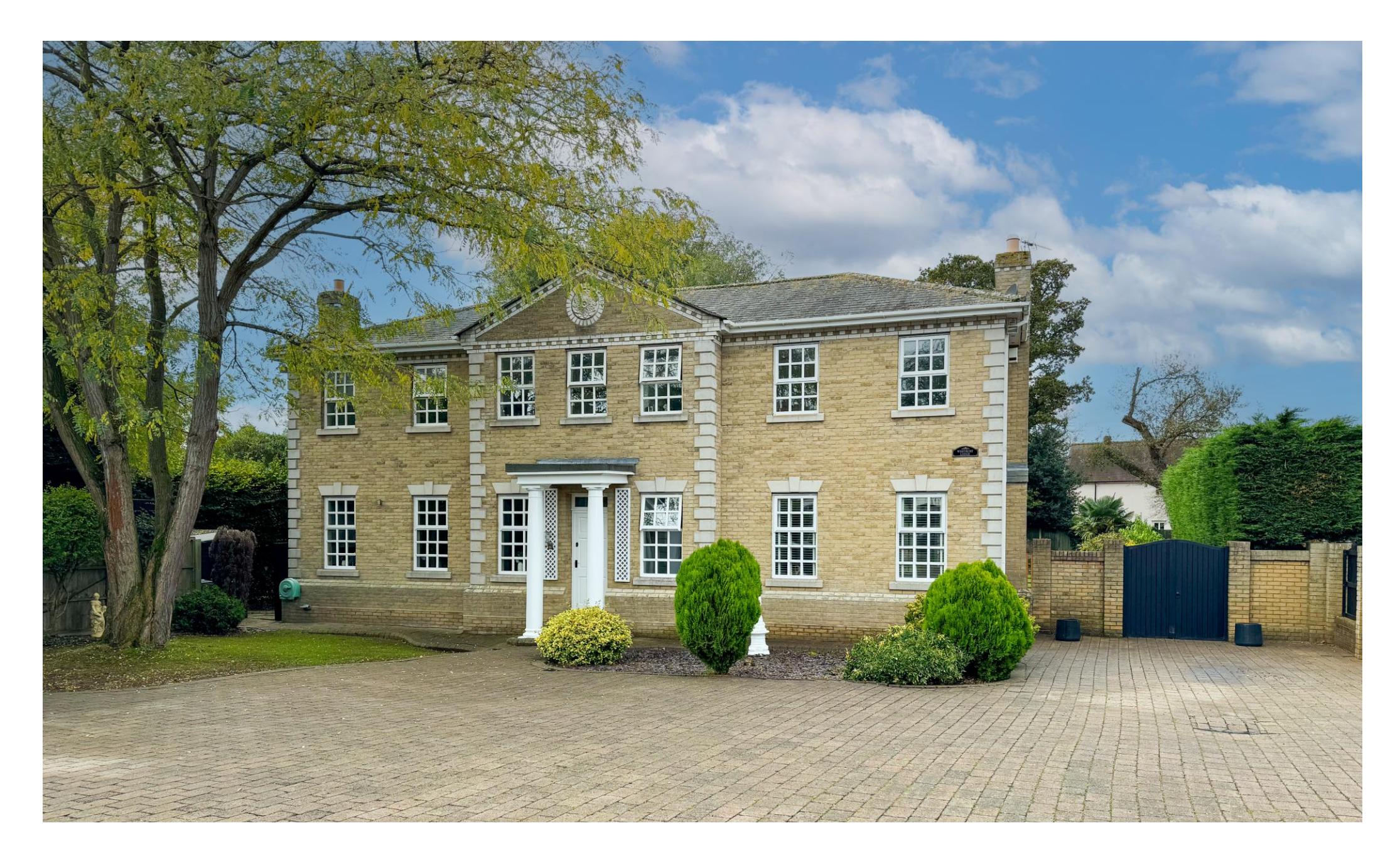
Westbury Lodge The Street | Ardleigh | CO7 7LD