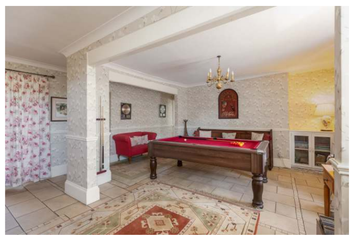
SITTING ROOM 5.0m x 4.3m (16'5" x 14'1")

Open fire with brick surround and stone hearth. Coving. Television point. Access to the cellar. Sash window to the front. Radiator.