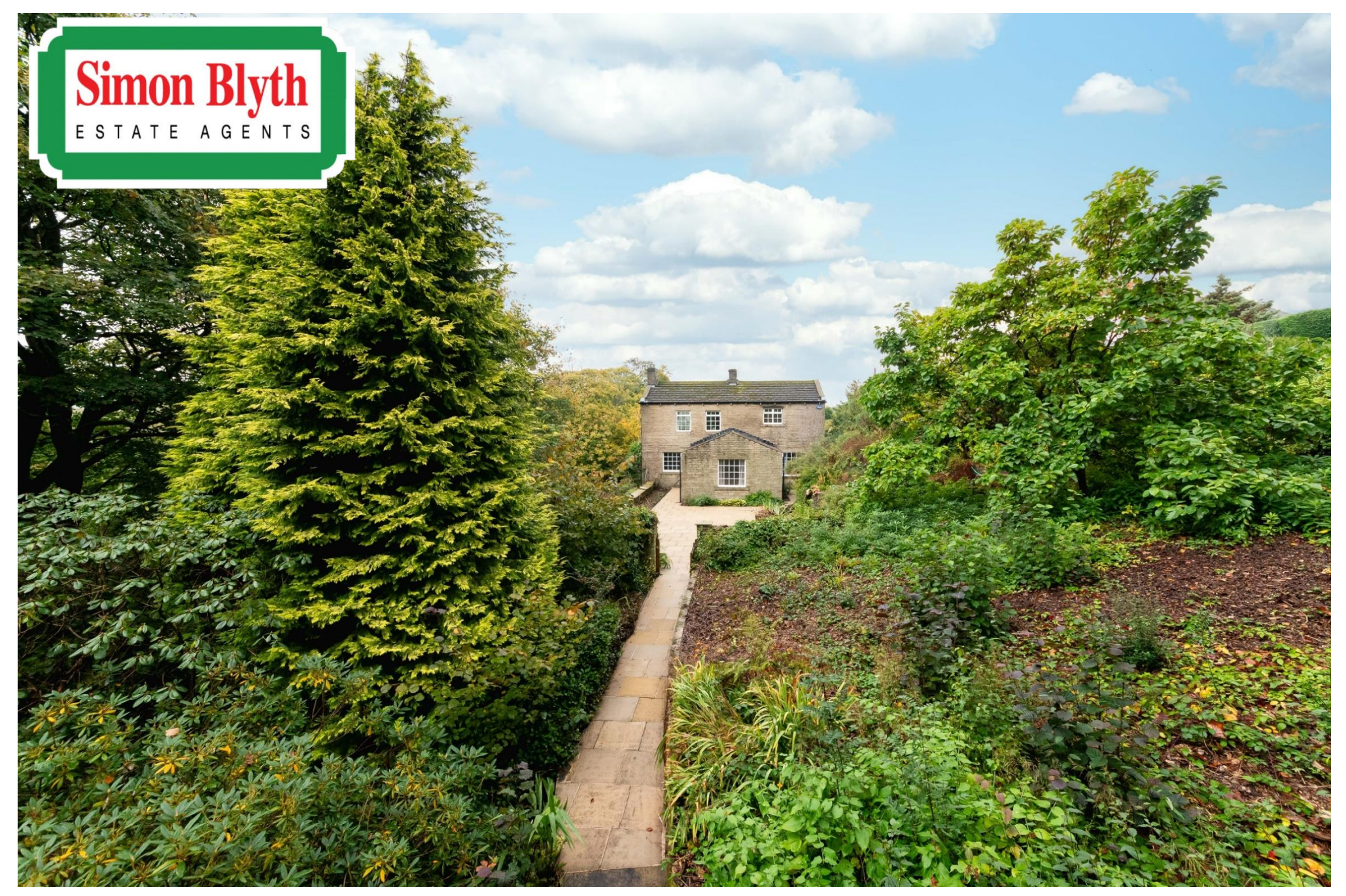
ACRE COTTAGE, ACRE LANE, MELTHAM, HD9 4DH