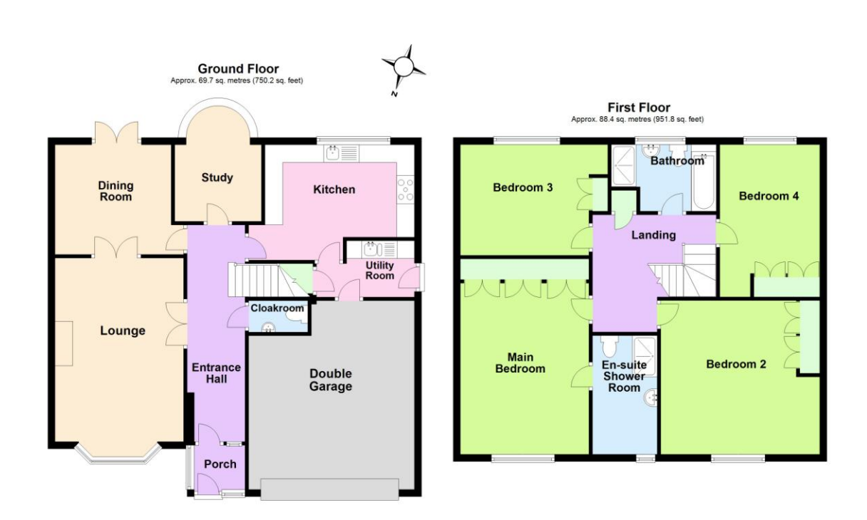
Total area: approx. 158.1 sq. metres (1702.1 sq. feet)