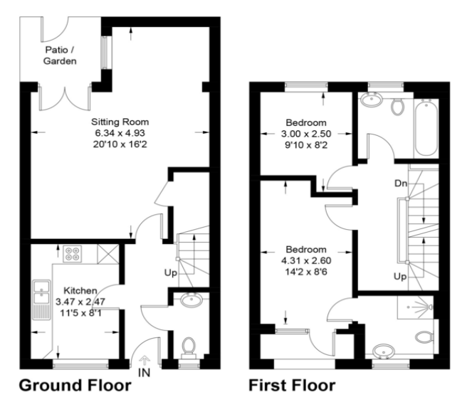
Illustration for identification purposes only, measurements are approximate, not to scale. Imageplansurveys @ 2024