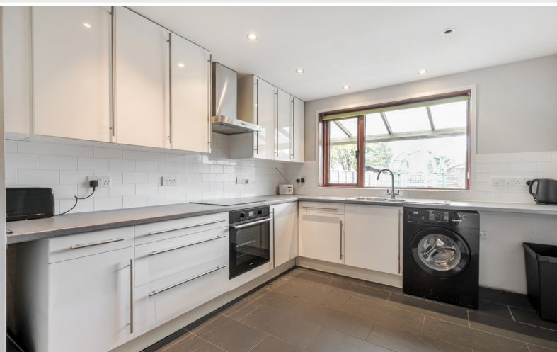
Kitchen/ dining room