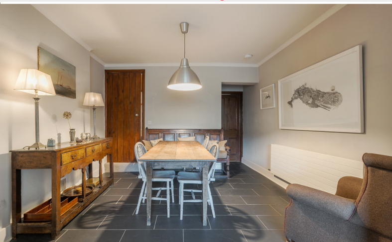
Kitchen/ dining room