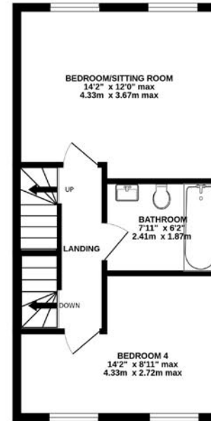
1ST FLOOR 382 sq.ft. (35.5 sq.m.) approx.