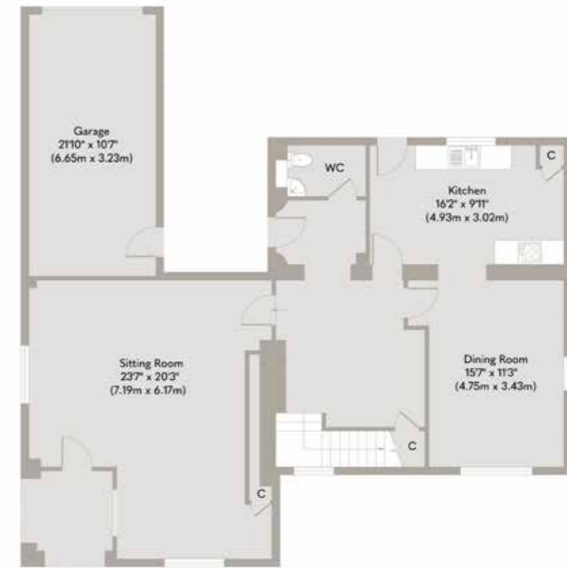
Ground Floor Approximate Floor Area 1,371 sq. ft (127.33 sq. m)

Whilst every attempt has been made to ensure the accuracy of the floor plan contained here, measurements of doors, windows, rooms and any other items are approximate and no responsibility is taken for any error, omission, or mis-statement. This plan is for illustrative purposes only and should be used as such by any prospective purchaser or tenant. The services, systems and appliances shown have not been tested and no guarantee as to their operability or efficiency can be given.