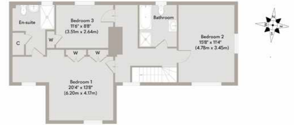
First Floor Approximate Floor Area 794 sq. ft (73.74 sq. m)