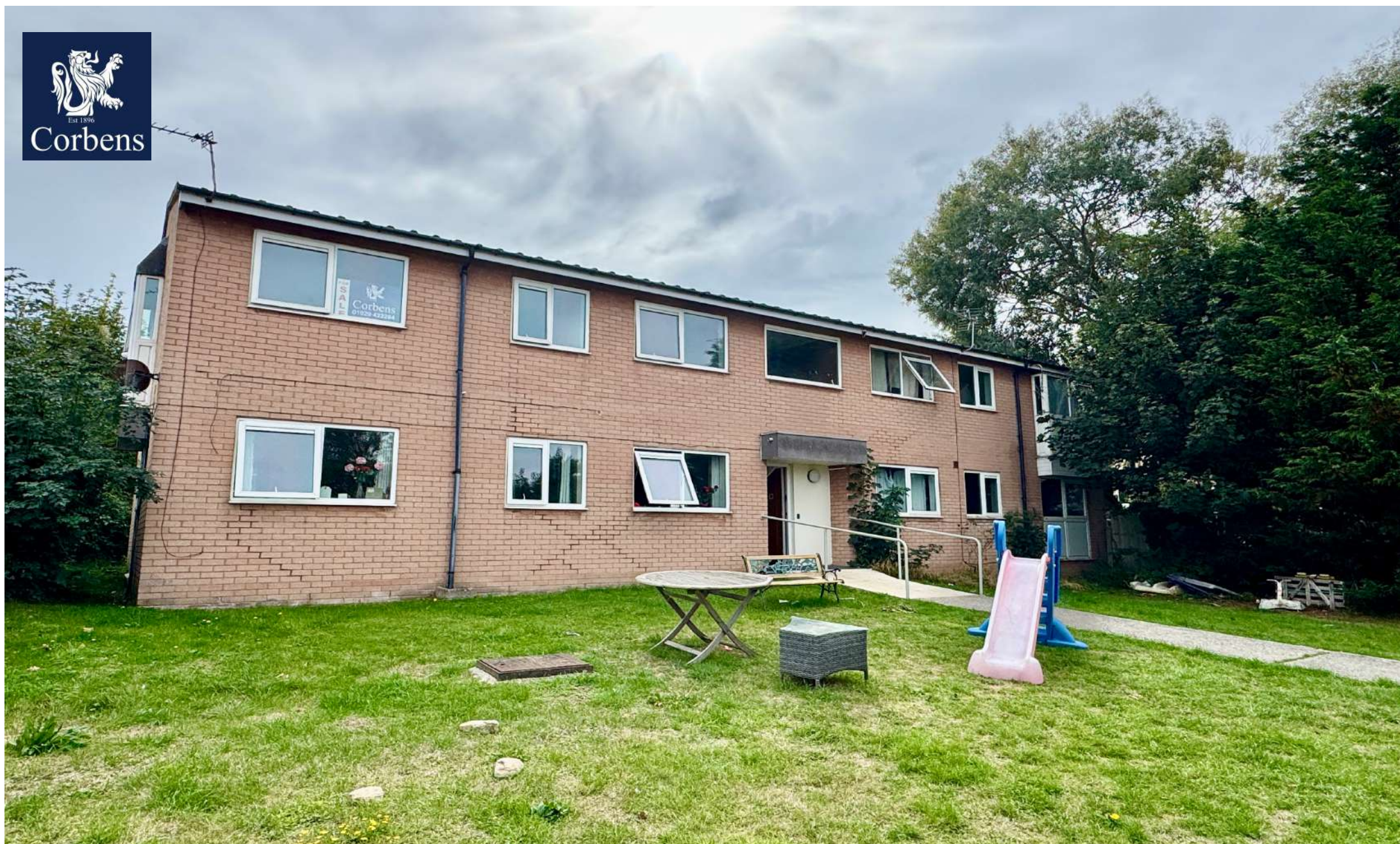
3 COW LANE, SWANAGE £185,000 Leasehold