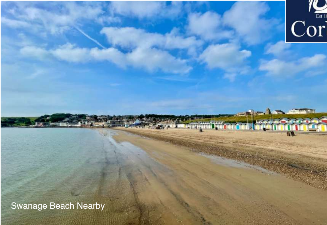
Swanage Beach Nearby