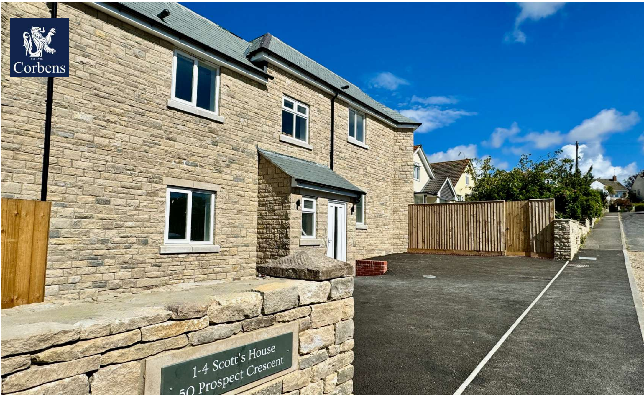
FLAT 3 SCOTT'S HOUSE, PROSPECT CRESCENT, SWANAGE £299,950 Shared Freehold