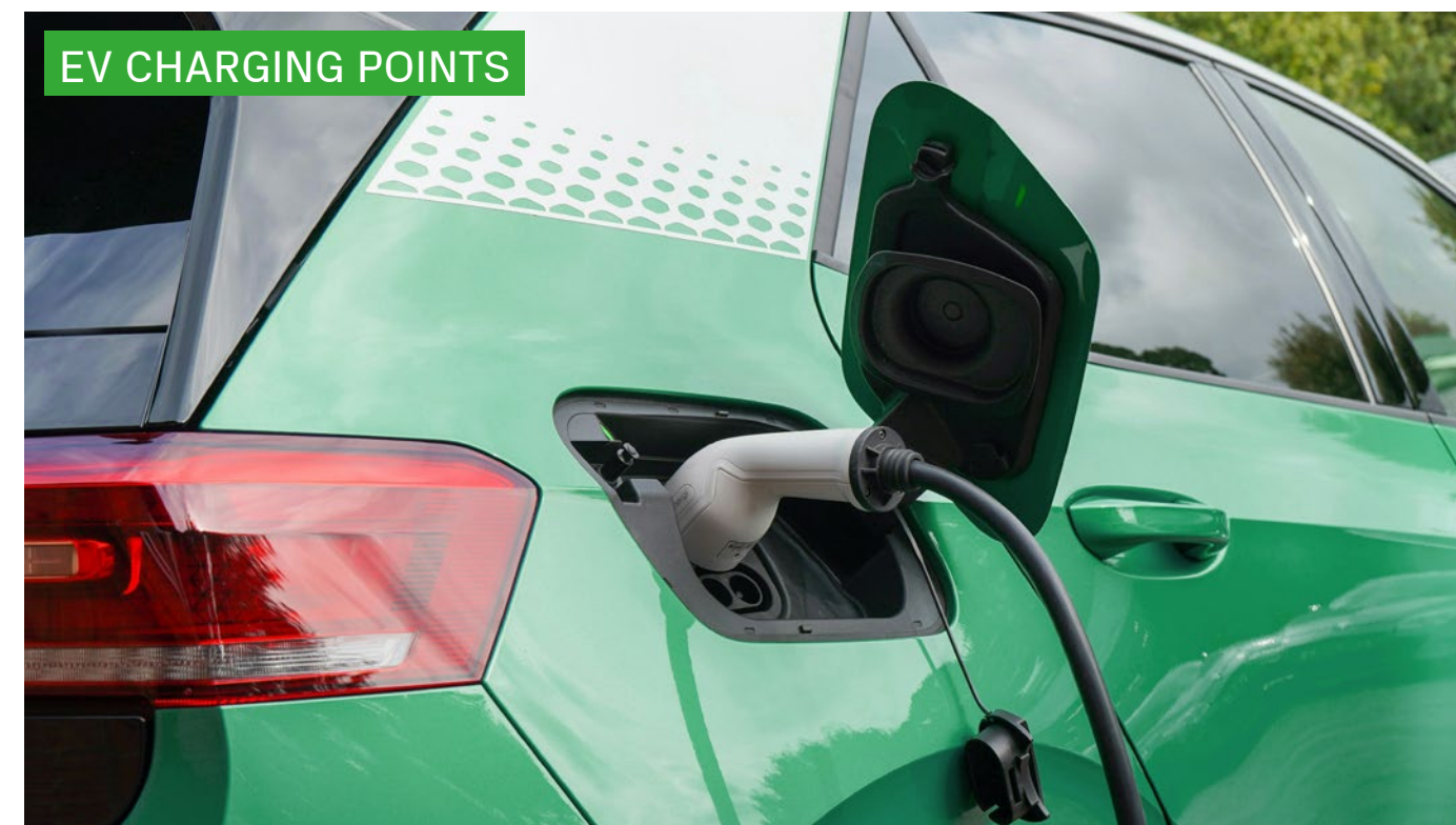
EV CHARGING POINTS