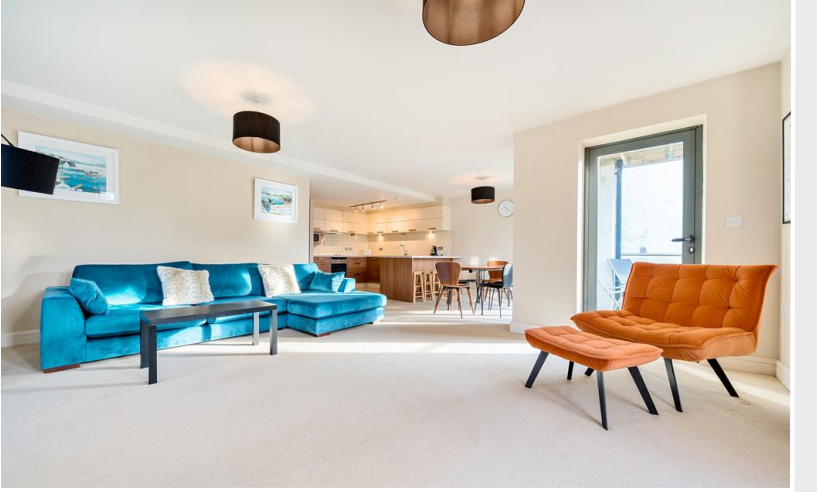
Open Plan Living Room & Kitchen