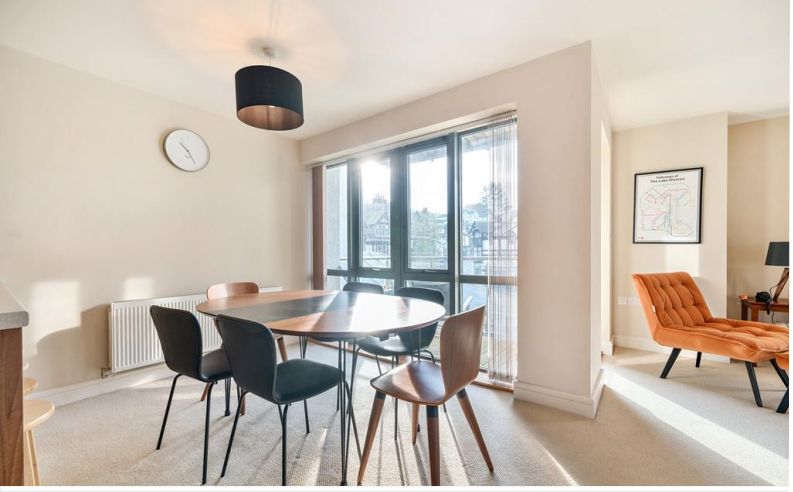
Open Plan Living Room & Kitchen