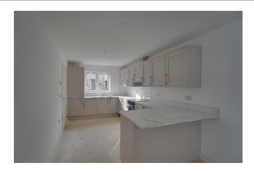
7 Chapel Court