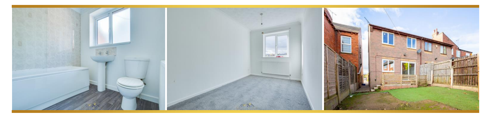
GROUND FLOOR 426 sq.ft. (39.6 sq.m.) approx.