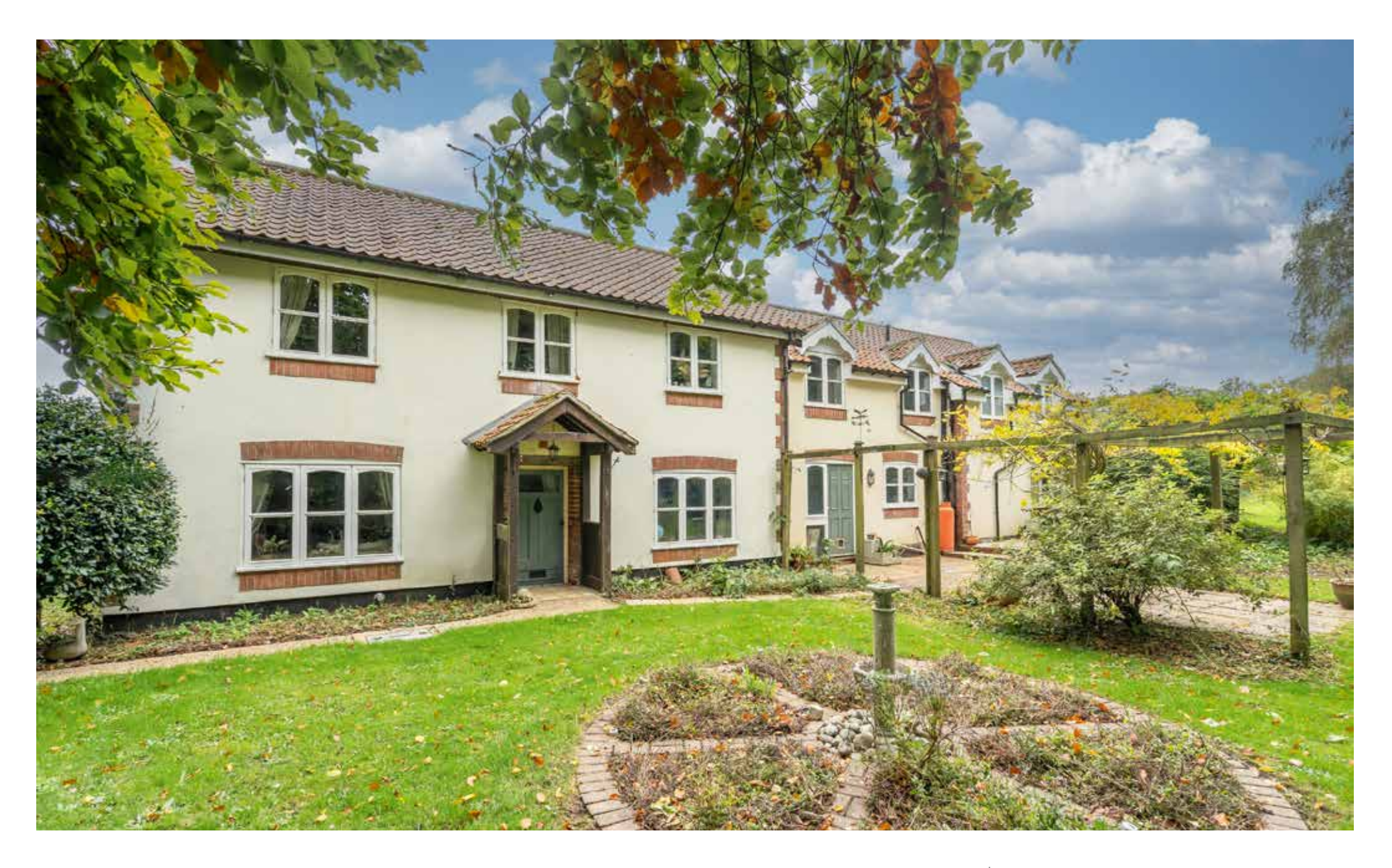
Holly House The Street | Lamas | Norfolk | NR10 5AF