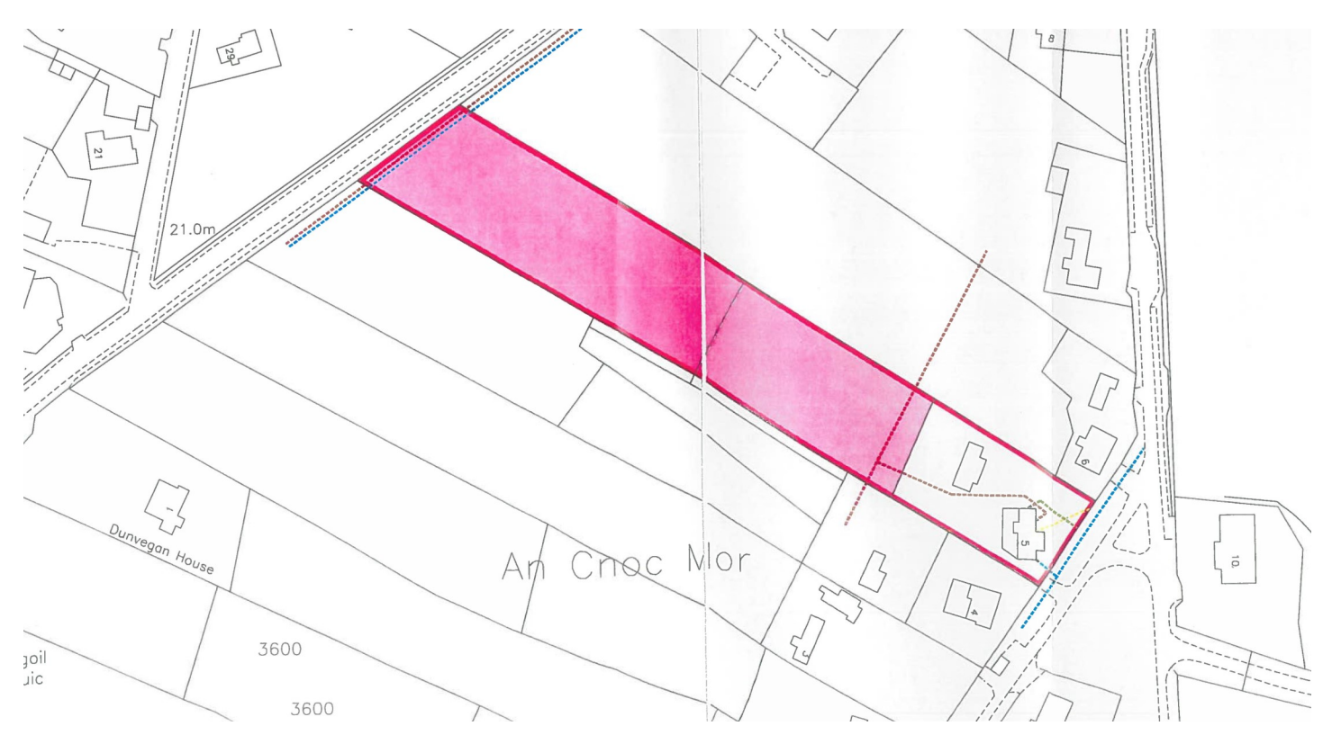
Holding highlighted in pink

Travelling out of Stornoway town centre passing the council offices and along Sandwick Road. Passing through Sandwick and Parkend and across the Braighe into the district of Point. Travel for approximately ¼ of a mile, passing the Point Shop to your right hand side. Continue along this road for 0.1 miles and the Holding at 5 School Park is situated on the right hand side.