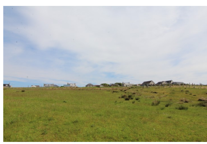
Holding at 5 School Park