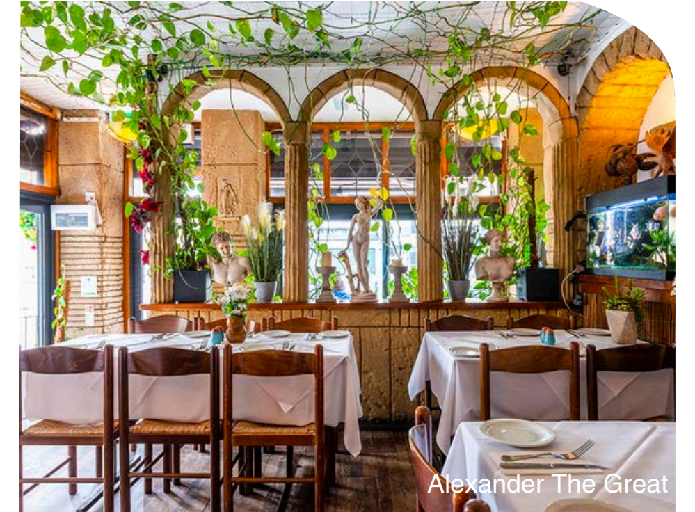
Alexander The Great

Experience the ultimate urban lifestyle with an array of amenities at your fingertips. Banks, post office, charming cafes, and restaurants are just steps away, offering a plethora of dining options for your team and clients. Indulge in the eclectic delights of street food and explore the iconic attractions of Camden Lock, all in close proximity.