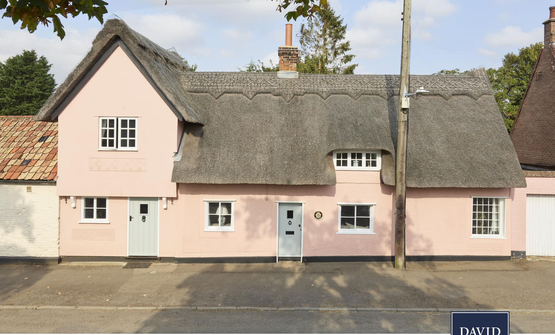
Lion Cottage Stoke By Clare, Sudbury, Suffolk