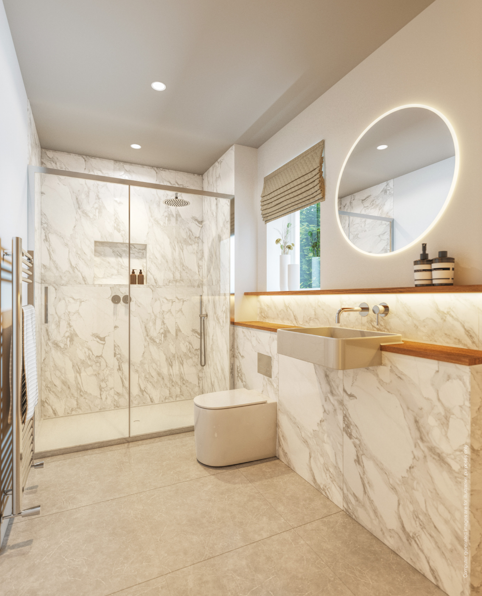
Computer-generated images are for illustrative purposes only