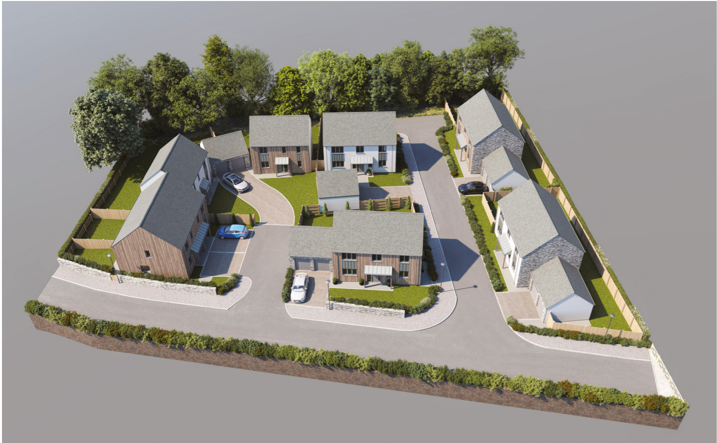
Computer generated images are for illustrative purposes only