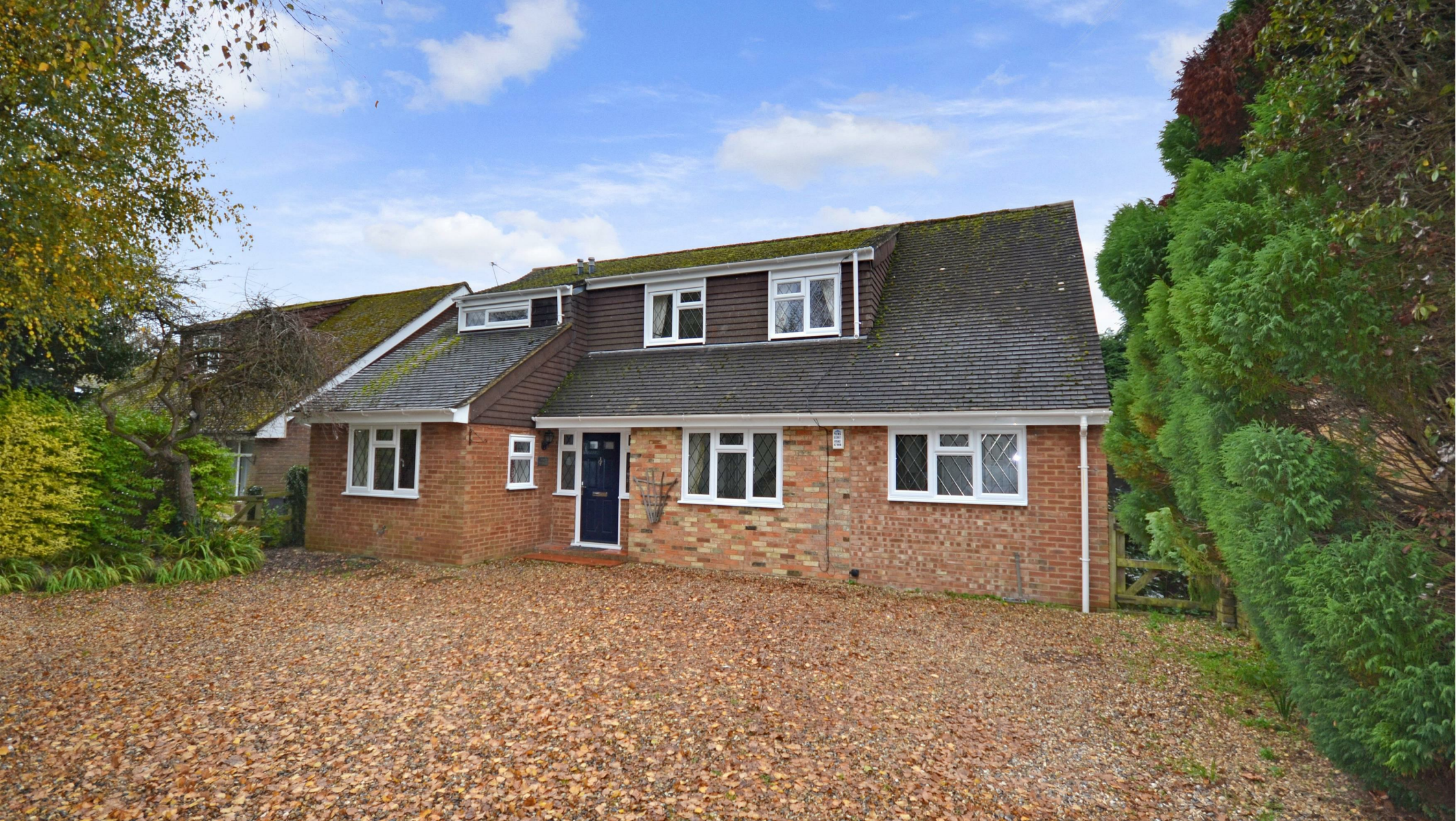
The Gables Pie Corner, Flamstead, AL3 8BW Asking Price £875,000