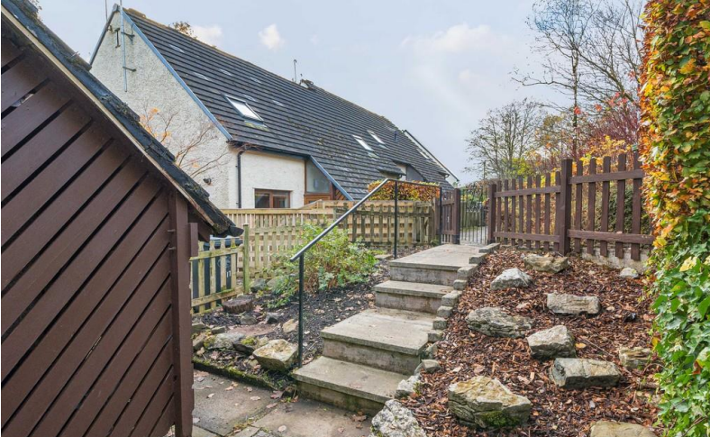
Front Garden Area