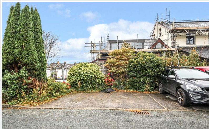
Allocated parking space