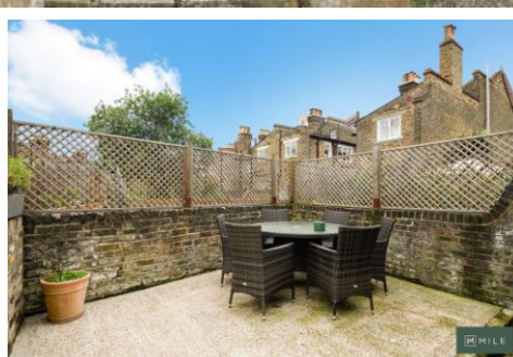
Fifth Avenue, London w10 £3,500 pcm

Welcome to Fifth Avenue. This spacious three-bedroom rental is located on the charming Fifth Avenue in London, W10. It boasts 1,185 square feet of well-maintained space, with the option for fully furnished living, making it ideal for those who want a hassle-free move. One of the standout features is the elegant, modern bathroom, adding a touch of luxury to this inviting home. Available from early January 2025, this property is ready for you to make it your own.