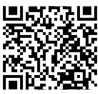
Scan for more details!

Westbrook, Lustrells Vale, Saltdean, BN2 8EZ 2 Bedrooms | Walking distance of the local shops | Lounge with balcony | Bus services to Brighton City Centre | Council Tax Band B | EPC Rating D