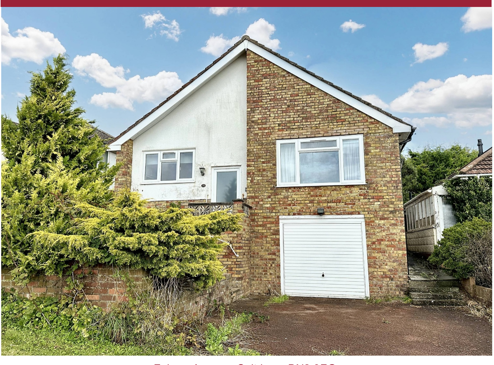
Falmer Avenue, Saltdean, BN2 8FG 3 Bedrooms | Very spacious entrance hall | No onward chain | Garage, Driveway | Good location in West Saltdean | Council Tax Band D | EPC Rating D