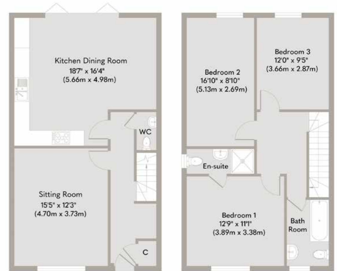
Ground Floor Approximate Floor Area 604 sq. ft (56.11 sq. m)