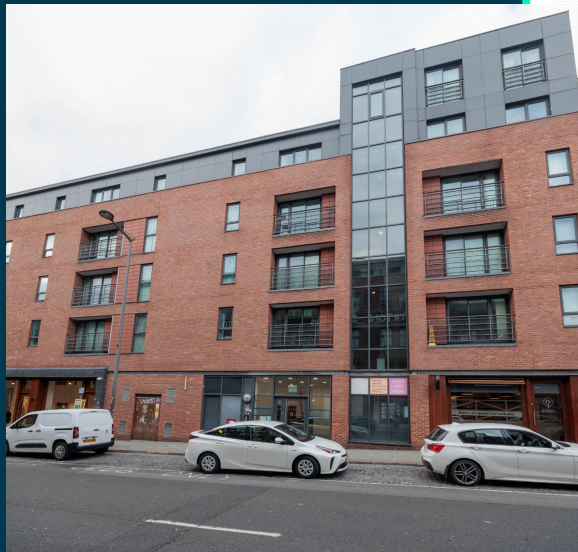
Portside House, Duke Street, Liverpool, L1 5AQ