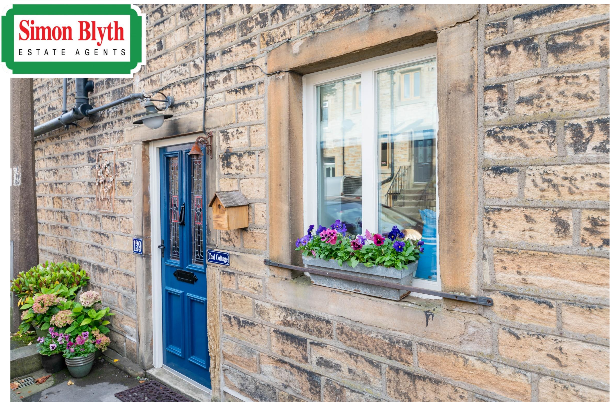
TEAL COTTAGE, WOODHEAD ROAD, HOLMBRIDGE, HD9 2NW