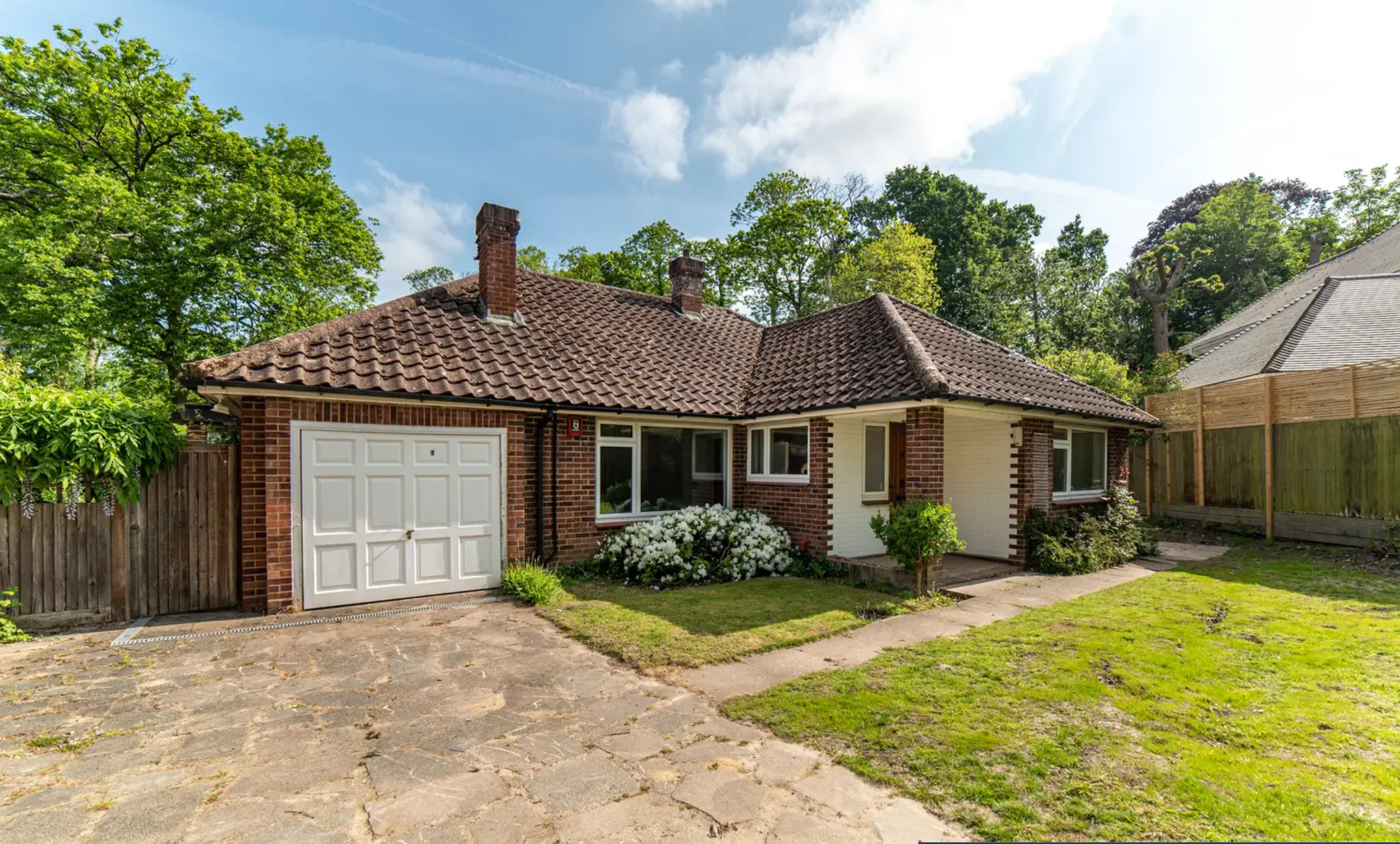
8 Fairmile Park Copse, Cobham £3,000 pcm