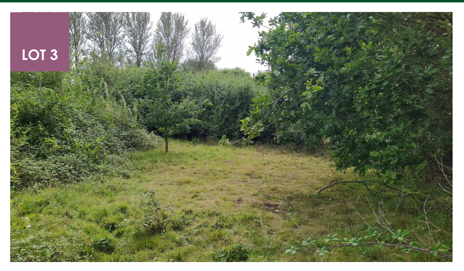
Guide Price £25,000 - £30,000*