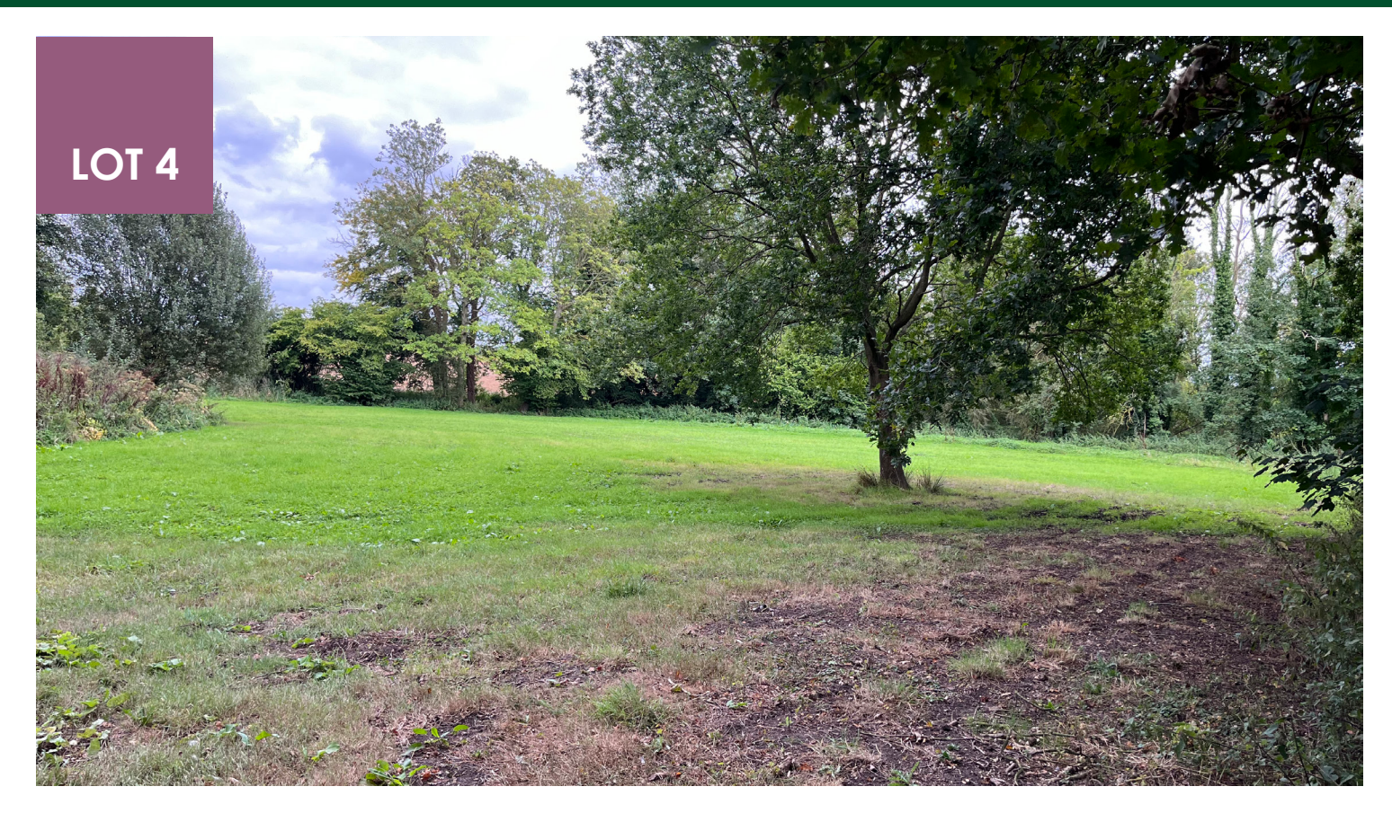
Guide Price £45,000 - £50,000*