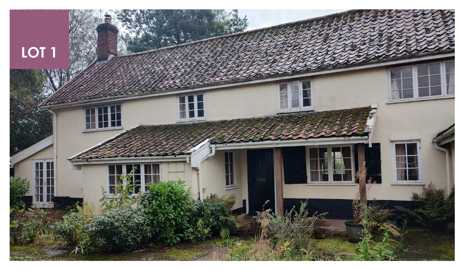
Guide Price £500,000 - £550,000*