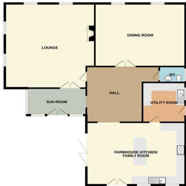
GROUND FLOOR 1637 sq.ft. (152.1 sq.m.) approx.