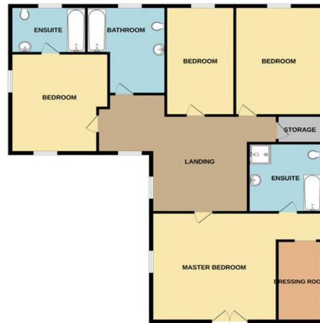
1ST FLOOR 1545 sq.ft. (143.5 sq.m.) approx.