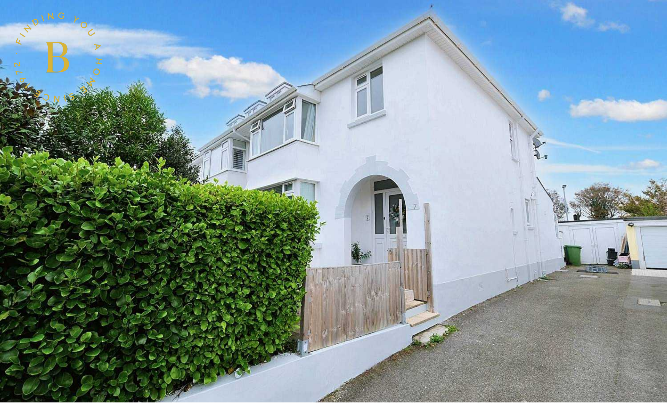
7 Highfield Villas La Pouquelaye, St. Helier £749,000