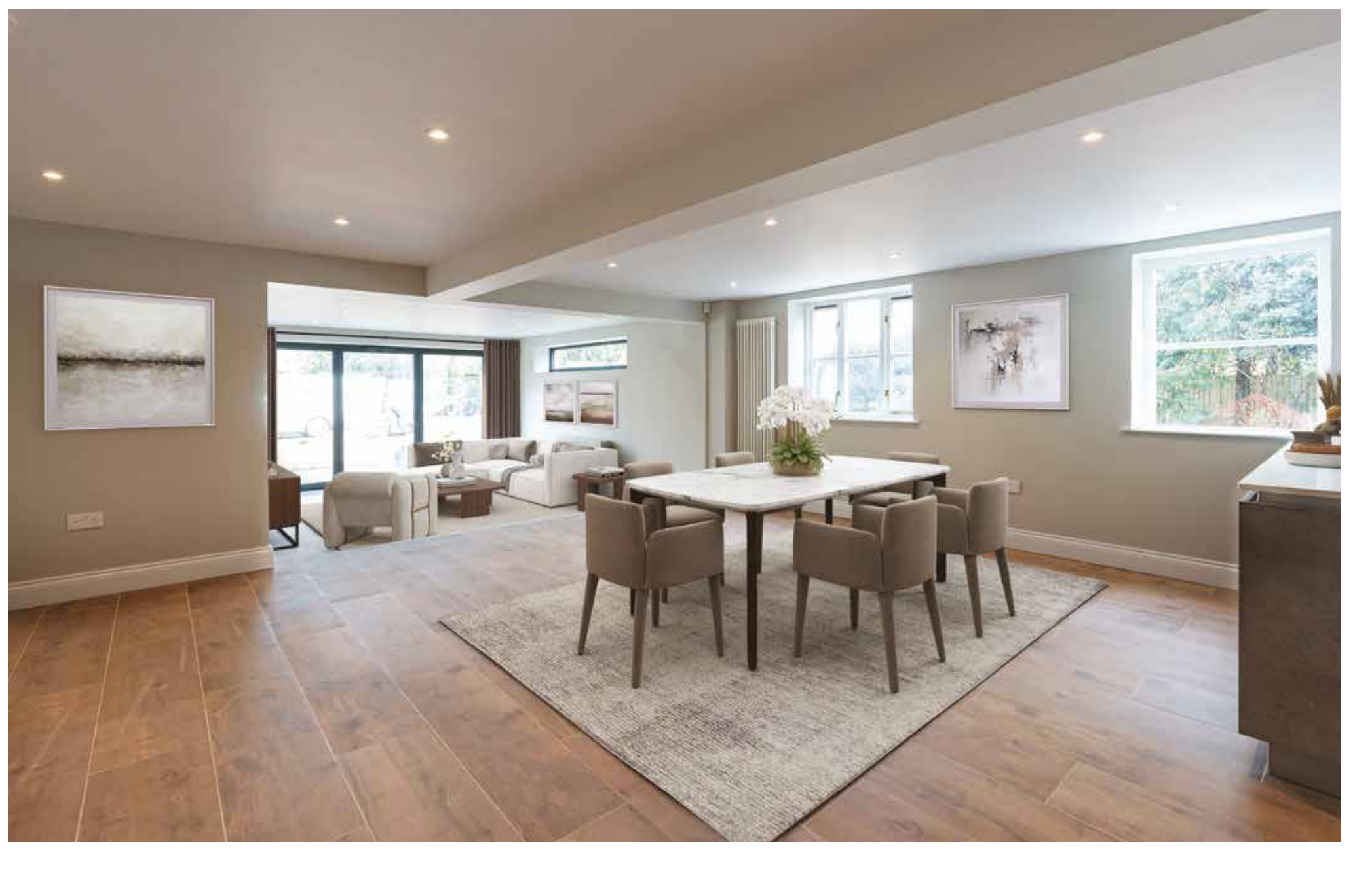
Additionally, both reception hall and sitting room have feature fireplaces with wood burning stoves. Separate staircases ascend to the first floor and a cloakroom completes the ground floor accommodation.