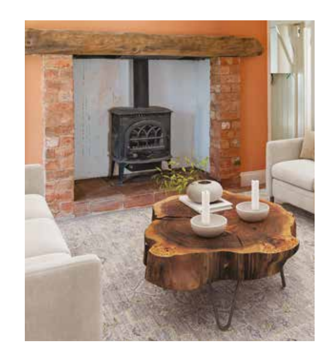
Welcome to The Thatched Cottage, an attractive 17th-century Grade II listed cottage located in the sought-after hamlet of Frilford, in South Oxfordshire.

Approx Gross Internal Area: 2,551 sq. ft.