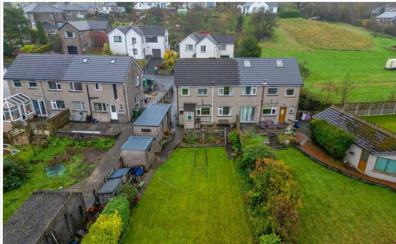
Elevated rear garden