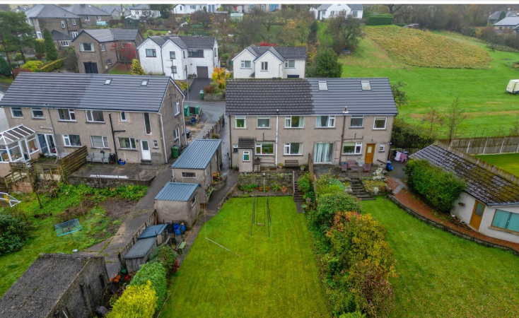
Elevated rear garden